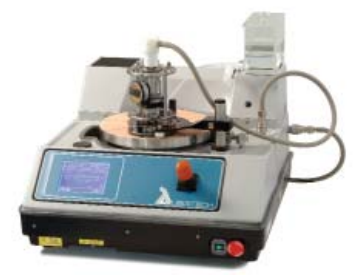
Logitech PM5 Lapping & Polishing System

In each case the objective of Sapphire, Silicon Carbide and Gallium Nitride wafer polishing is to reduce the final thickness of the substrate to the required target value, with a TTV of better than +/-2 microns and an improved surface roughness of less than 2nm. This is achieved by firstly bonding the wafer(s) to a rigid glass substrate, using the Logitech Wafer Substrate Bonding Unit (WSBU).