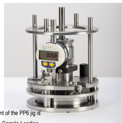
Fine adjustment of the PP6 jig is easy using the Sample Loading Gauge.