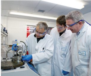
System training at Logitech's purpose built laboratories

The purchase of each machine system from Logitech entitles the purchaser to receive free operator training at our purpose built laboratory facilities in the United Kingdom.