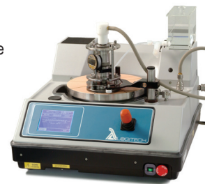
Logitech PM5 Lapping & Polishing System

Available in each of these machines, Logitech's unique patented automatic lapping plate flatness control system helps increase the level of precision achieved with each of these processing systems. By removing the requirement to spend valuable time on process plate maintenance, the automatic lapping plate flatness control system ensures that the plate maintains its preset shape throughout the lapping / polishing process.