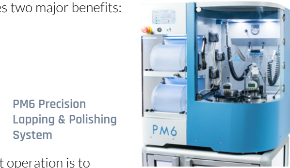
PM6 Precision Lapping & Polishing System